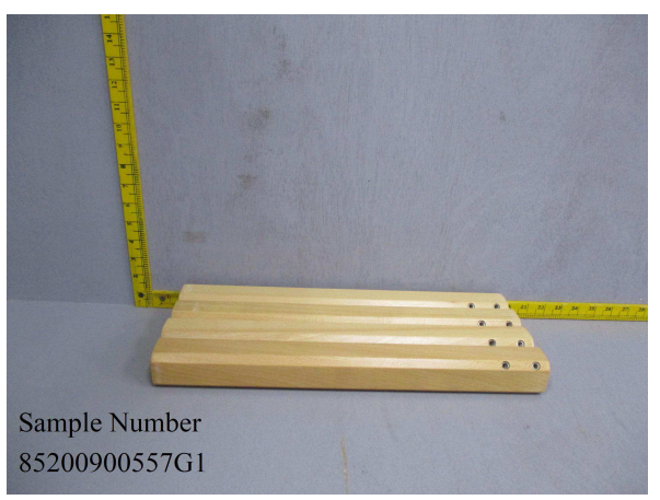
END OF REPORT